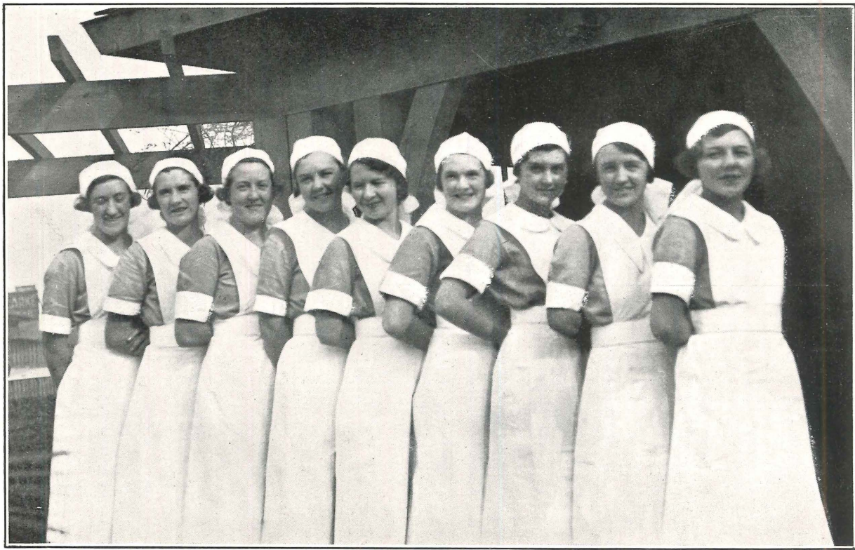
Group of "Primrose" Trainees.