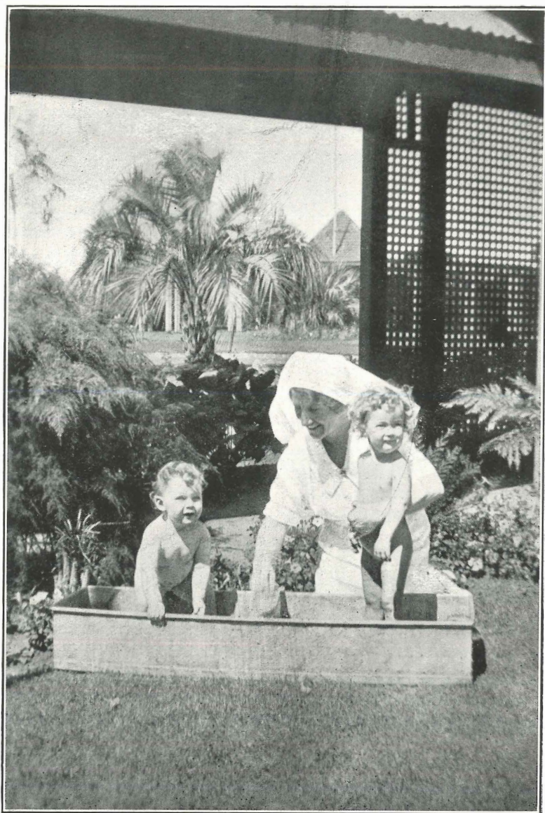
A Sunbath in the Hospital Garden: