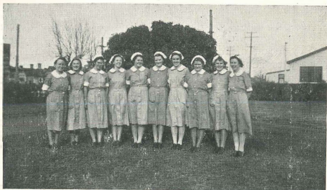
A GROUP OF TRAINEES IN MOTHERCRAFT

The Tweddle Hospital for Babies and School of Mothercraft