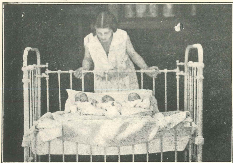
PREMATURE TRIPLETS A TRIBUTE TO TWEDDLE CARE

The Tweddle Hospital for Babies and School of Mothercraft