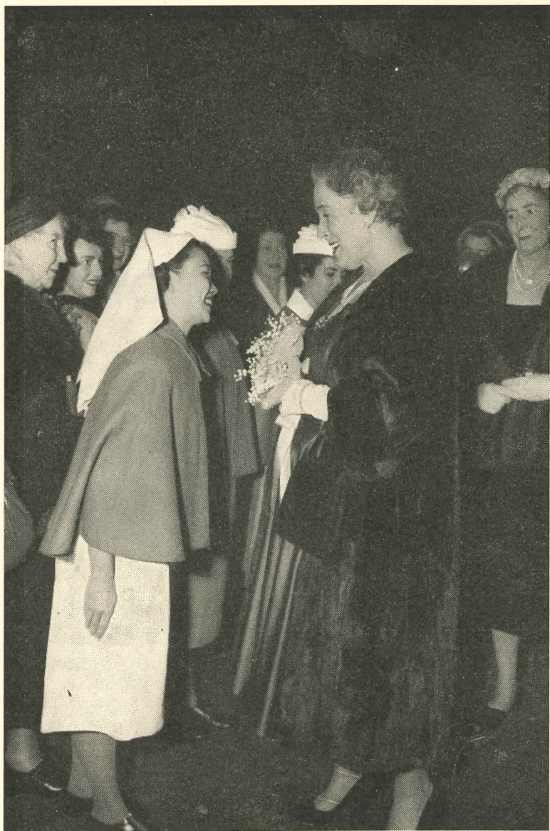
Her Excellency, Lady Slim, at the Opening of the New Tweddle Hospital on 11th June, 1959