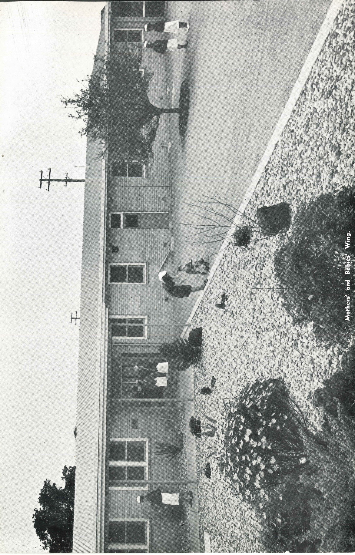
Mothers' and Babies' Wing.