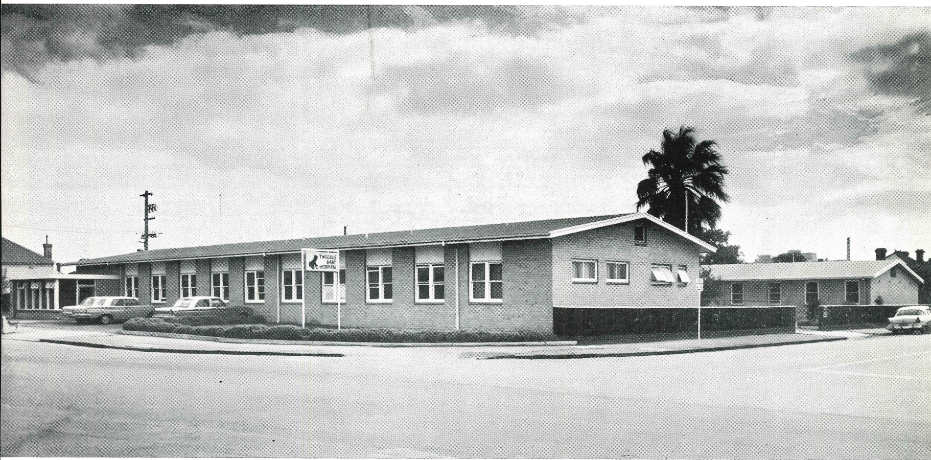
View of Main Hospital from south-east corner.