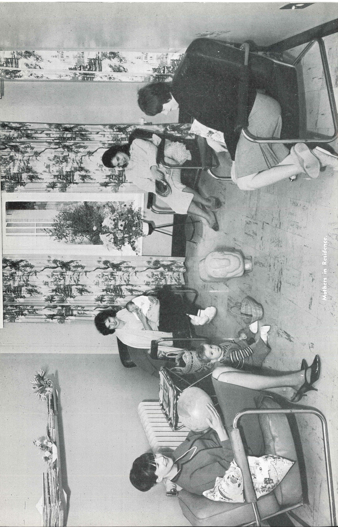
Mothers in Residence.