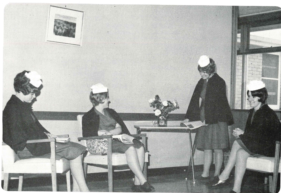
Mothercraft Nurses relaxing in their pleasantly appointed lounge.