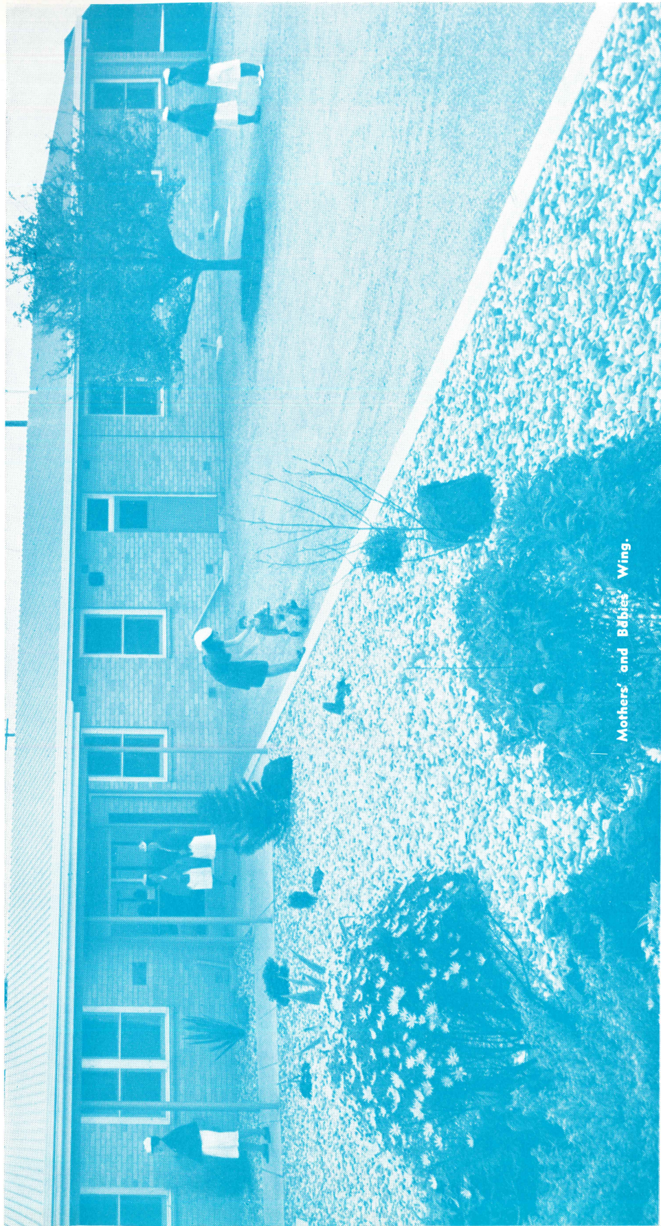
Mothers' and Babbies' Wing.