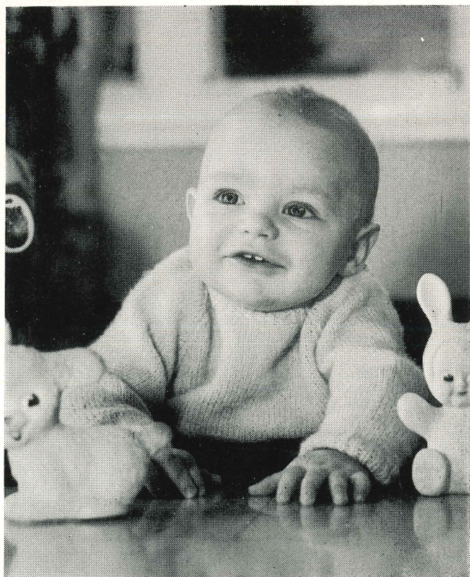
Below: The laughing baby is a Turkish child — one of the many children of migrants who are growing up to be splendid Australians.