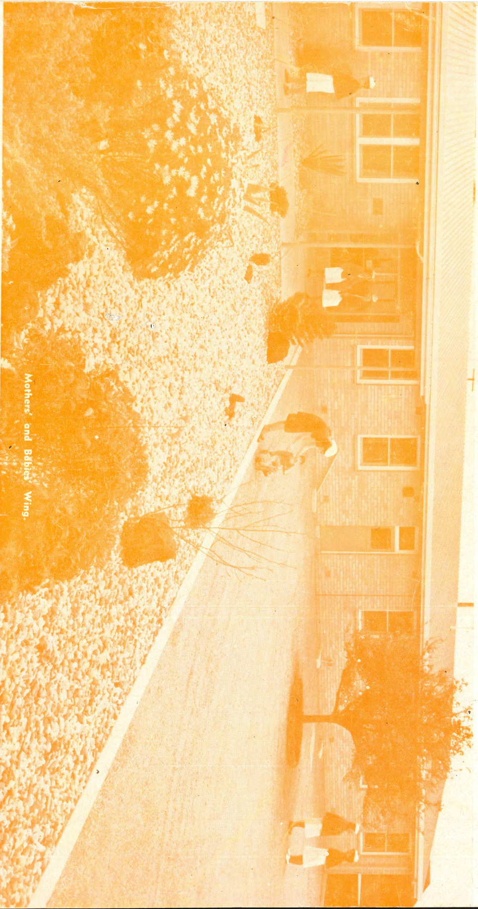
Mothers' and Bibles' Wing.