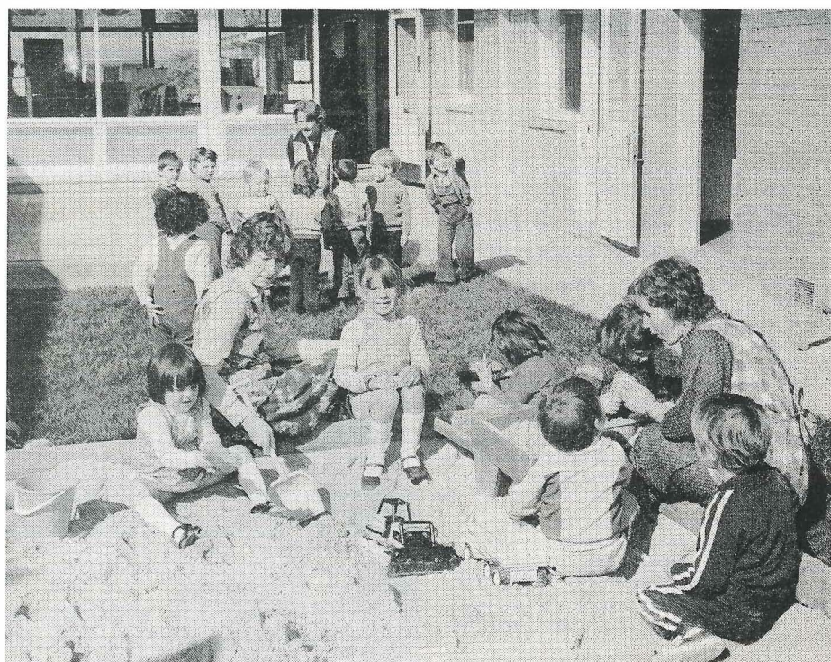
All good friends and jolly good company. A kindergarten group happily at play.