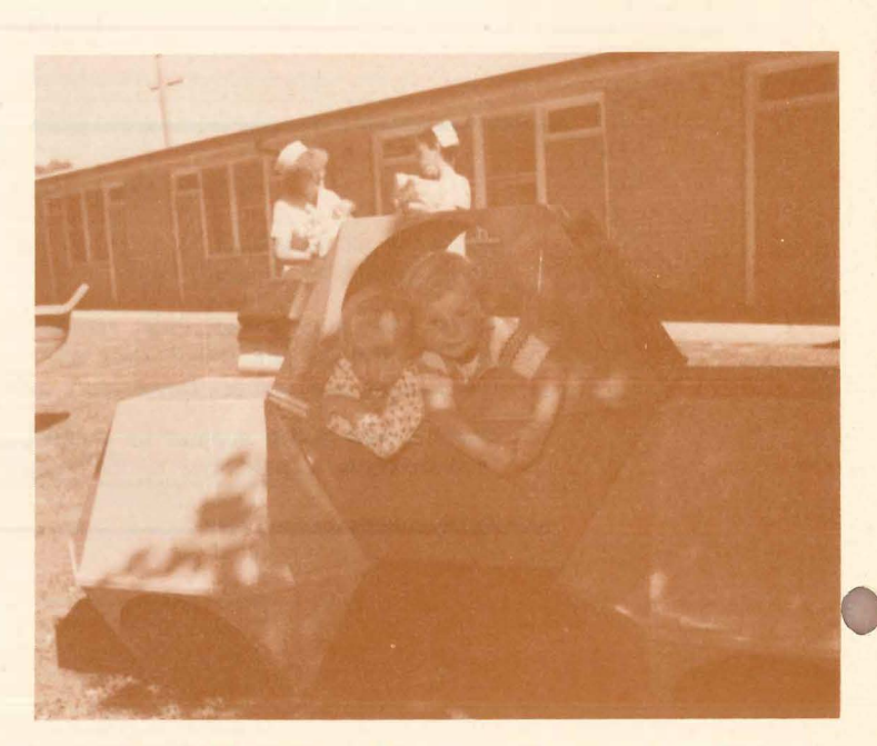
Twins Chrisie and Steven play in one of Tweddle's interesting play things.