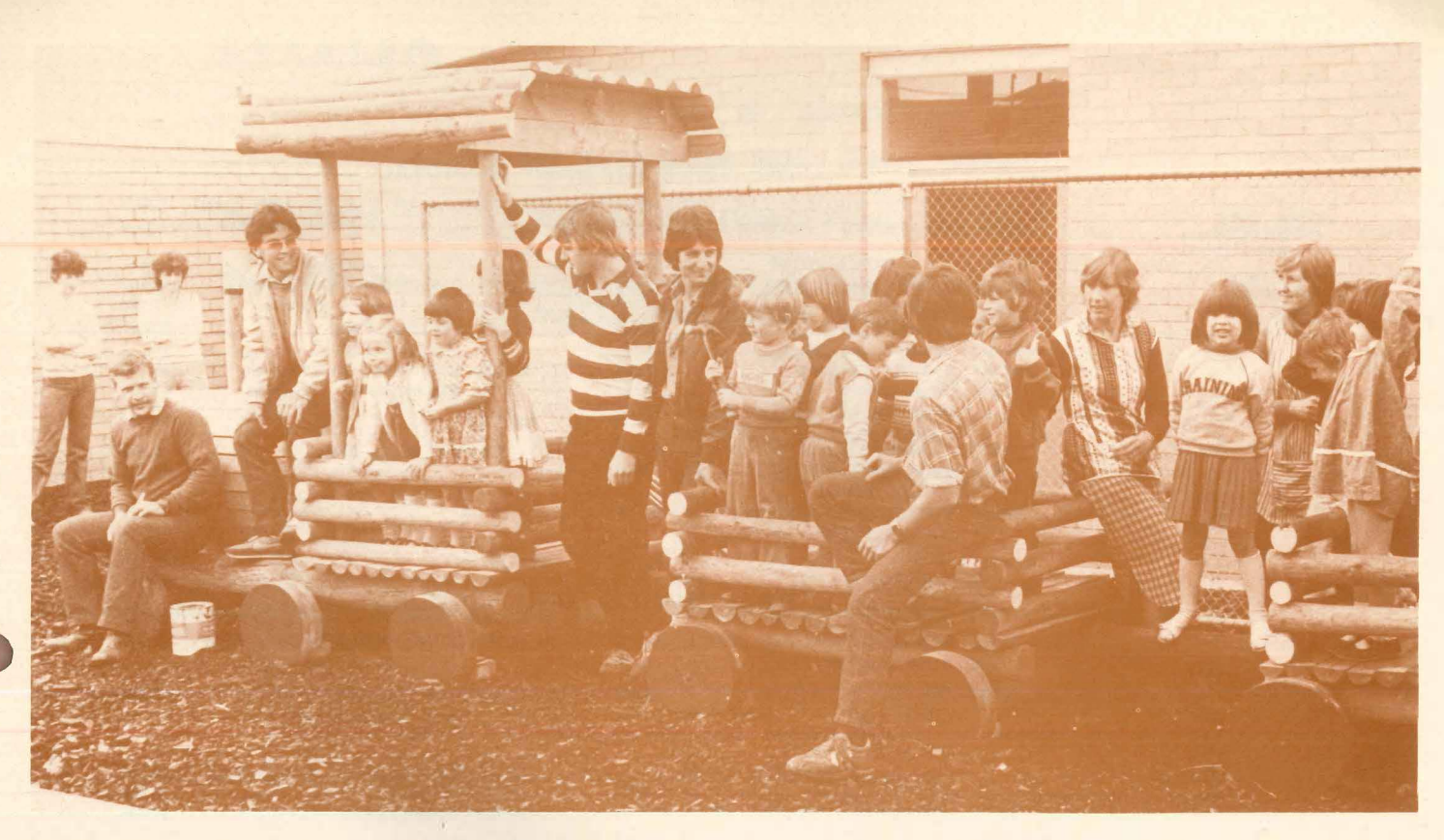
Above. Built by Group 3 final year carpentry and joinery student apprentices at the Footscray Technical College a 30 metres wooden train with carriages is giving the kindergarten children great joy.