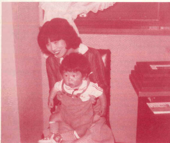
Delightful Japanese mother and son.