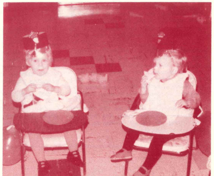
Twin enjoying party