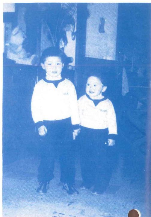
The Lay Boys