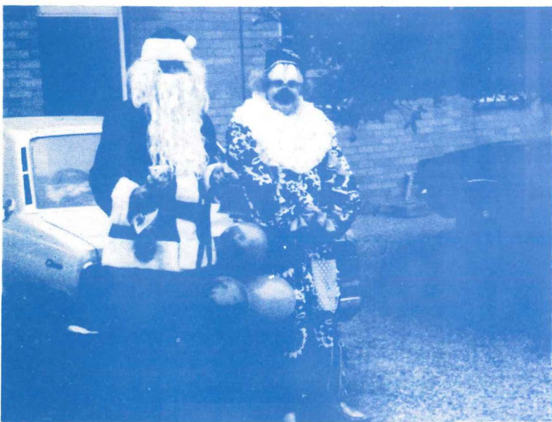
Santa and Clown